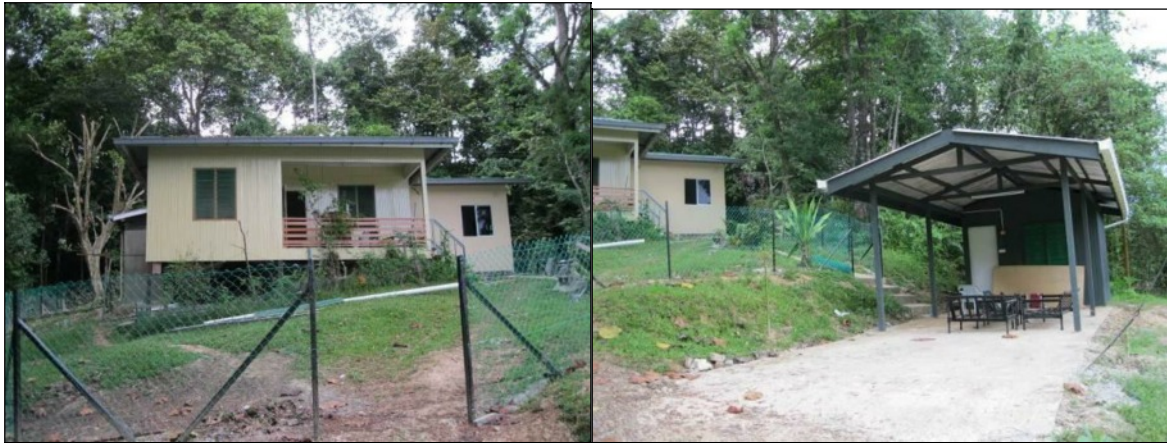
(left) BORA field manager / veterinarian's house and (right) garage were renovated in June