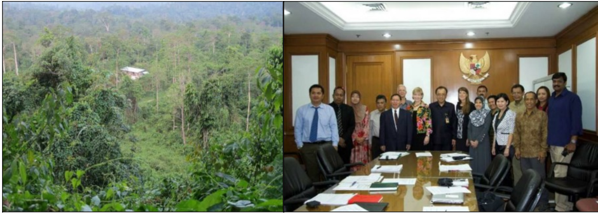
(left) view of the location of the proposed Rhino Food Garden near to the Rhino Quarantine Facilities, (right) Sumatran Rhino GMPB meeting in Ministry of Forestry Indonesia, 15 March, with Director-General of Forest Protection and Conservation, Bpk. Darori, in middle