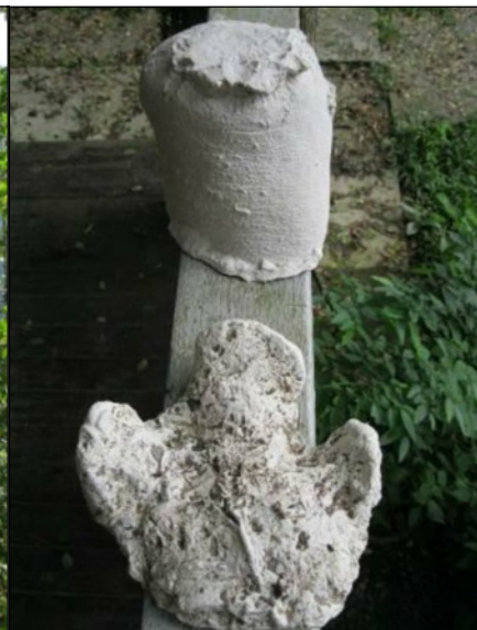
(left) typical steep topography of forest land in the Kuamut region visited 18-21 June, (right) plaster casts of rhino footprints were left with two logging contractors at Kuamut, as a prompt to staff and workers to seek and report rhino signs (the upper cast in this picture is of Puntung's front left foot, taken as an aid to designing a prosthetic foot).