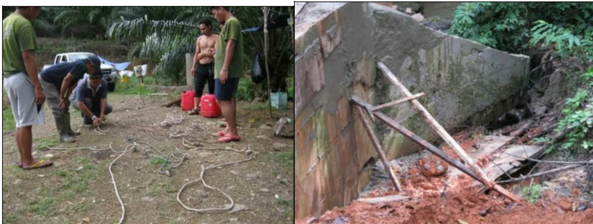
(left) 10 jerat (snare) ropes retrieved from forest near to the Kulamba rhino trap (February 2012), three are big enough to cause the death of a rhino, (right) view of the BRS access road ("Pakej A") box culvert (6 June), showing additional "patching up"

Appendix 1. Text of Sumatran rhinoceros GMPB Letter of Intent for Collaboration on Ensuring the Survival of the Sumatran Rhinoceros