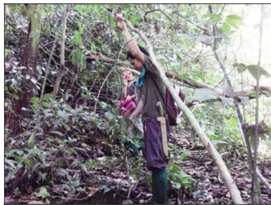
(left) natural salt spring found during a mid-May survey for rhinos, along Tabin river, near to Burung river, (right) jerat set for large mammals in same area