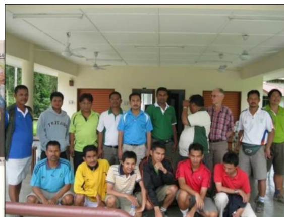
(left) Daily Express (Sabah report, 16 March, on rhino walk, (right) group from KLK plantations (adjacent to TWR) visits the BRS interim facilities (10 May).