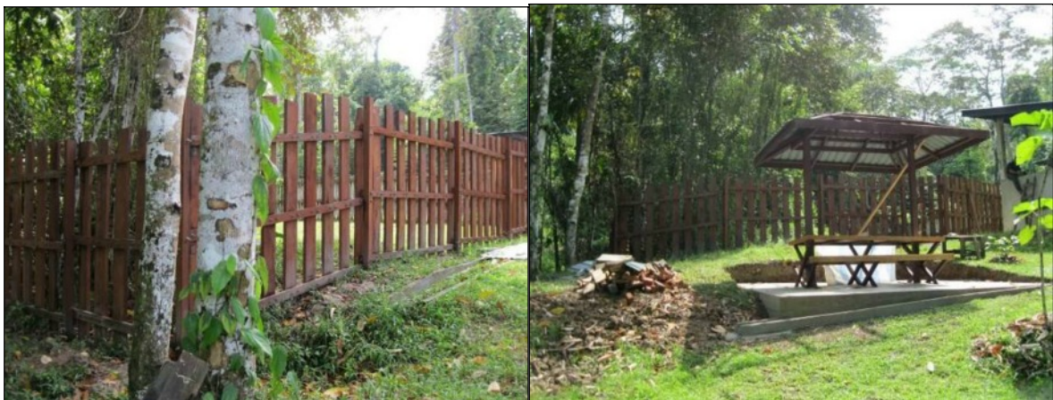
(left) external view of the rhino breeding yard fence at the rhino interim facilities, completed at end of June, (right) one of two gazebos completed in June at the rhino interim facilities