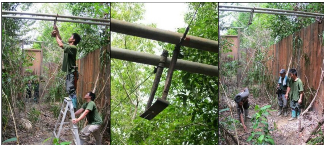
(left) the inside end of each cable is tied to an ironwood peg, (middle) close-up view of the final trigger design, with ironwood pegs held in place by a combination of galvanised iron cross pipes above and, below, a steel plate with a flange at each end, (right) when a large animal enters the trap, it will push an arrangement of barely-visible, fine plastic-coated wire, that pulls the steel plate downwards and simultaneously releases the ironwood pegs, cables and doors within 1 second.